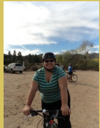
Mountain biking with Monarch at Mission Gorge.