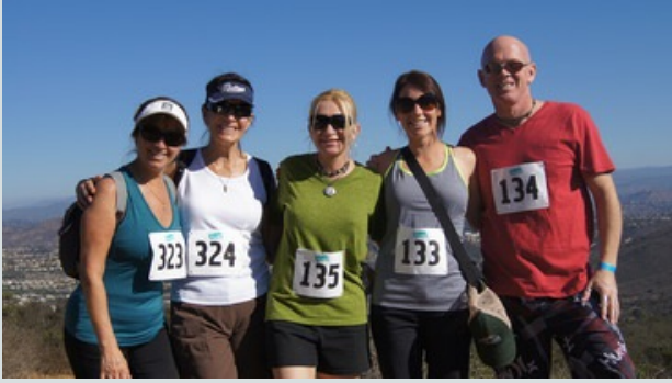
[Smiles all around at Reach the Peak]

Thank you to everyone who made this year's Reach the Peak a success, including our outstanding volunteers and event sponsors. Make sure to check out all the action shots that our photographers took at the event here .