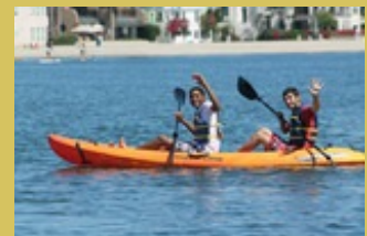
Adventure Club youth kayaking in Mission Bay