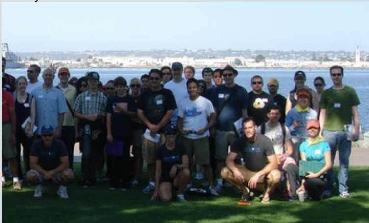
Last year's Puzzle Pursuit Participants getting ready to start the race!

Interested in participating? Click here to sign-up today! We hope to see you there.