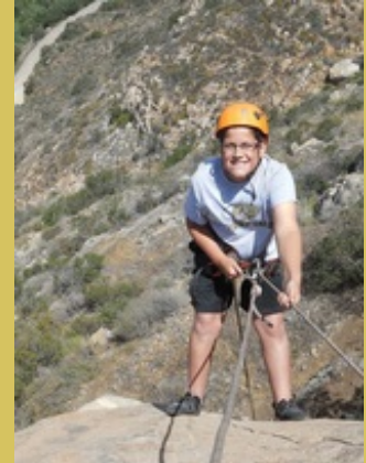
One of our Military Initiative participants climbing at Mission Gorge